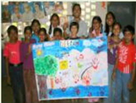
Activity Based Learning