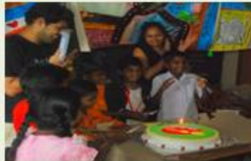
Light the Spark