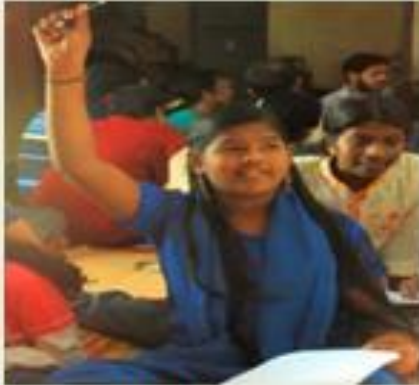
Make Children Curious / Ask Questions