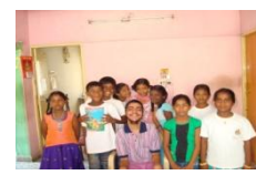
Mini Lib Visit